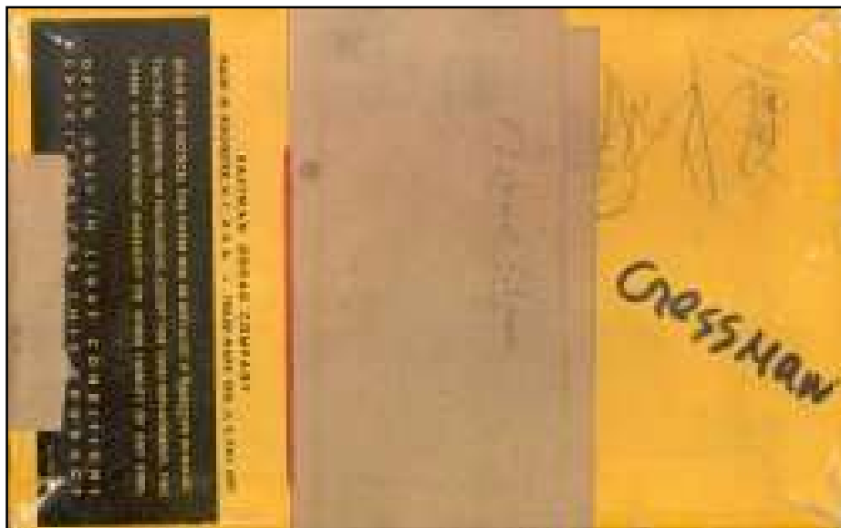
Figure 1: Top of film box in which the artifacts are stored.

Through an odd series of coincidences, I recently became aware of a box of artifacts currently being curated in the Museum of Natural History's paleontology collection. Written on the top of the box are the words "Cressman" and "Flaked Stone" (Figure 1). Stamped on the side of the used Kodak photographic paper box is the date "J '48 21".