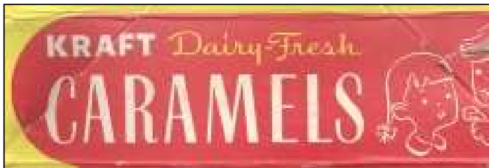
Figure 2: Caramel box lid used in packing.

Packed inside under the protection of a piece of cardboard from a "Kraft Dairy Fresh Caramels" box (Figure 2) are 108 flaked stone artifacts, primarily an assortment of bifaces, biface fragments, and projectile point fragments. There are no notes associated with this small collection and there is absolutely no clue as to the origins or archaeological provenance of the artifacts.